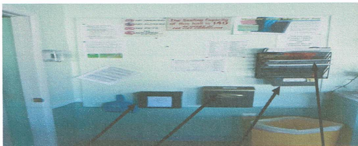
Dark house box Code Complaint Newsletter Articles, Newsletters and forms Box